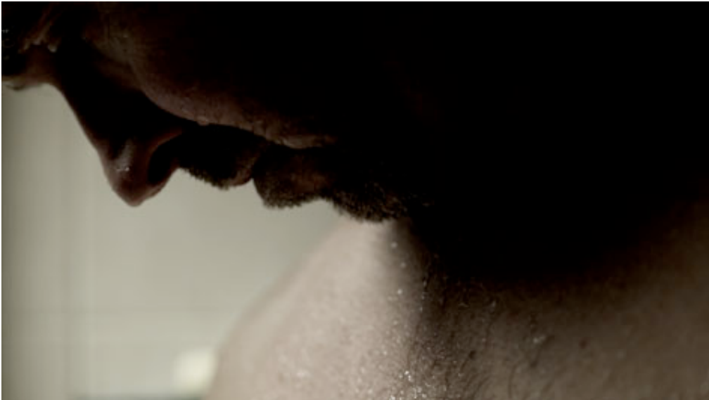
Still from Night Time Room

Location: Picture This Atelier, Bristol, UK