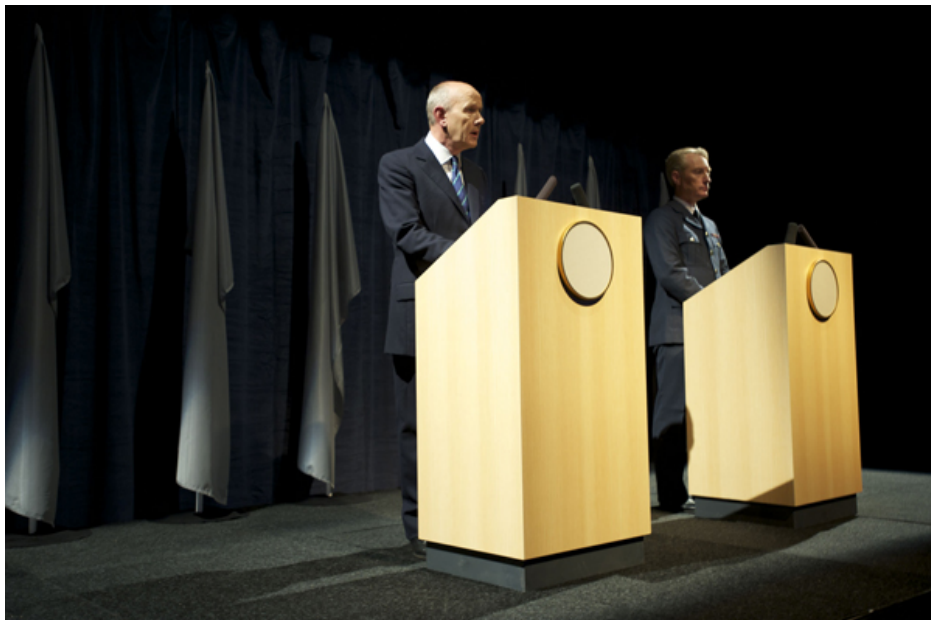
Who, What, Where, When, Why and How, (2009)